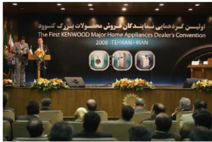
Kenwood Ceremony in 2008