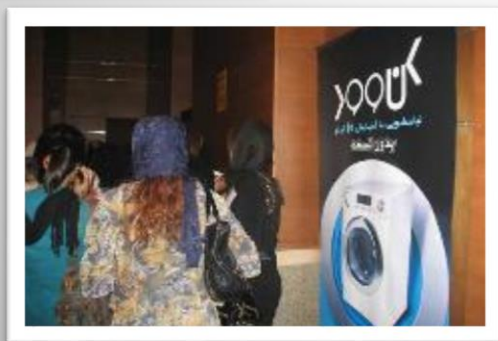
Fashion Show Sponsored by Kenwood