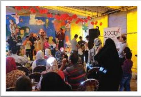
Charity Help Sponsored by Kenwood