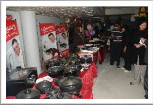
Charity Help Sponsored by Dessini