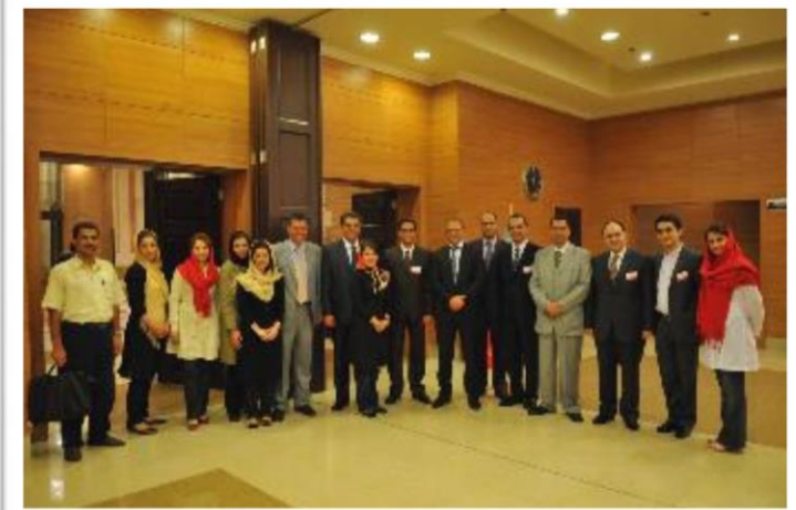
Dessini Seminar in Tehran 2009