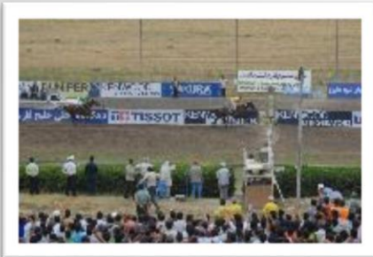
Sport Sponsoring Horse riding