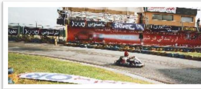
Sport sponsoring Carting