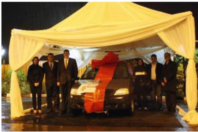
Seminar for Kenwood Dealers

Over 100 Events & seminars organized over the years for our different clients