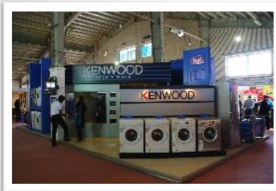
Kenwood exhibition Urmia