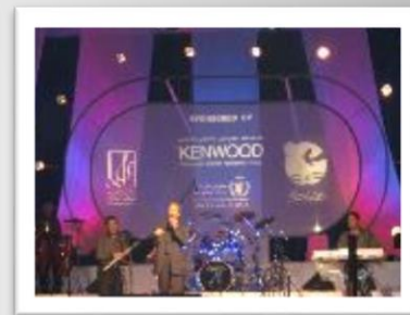
Kish festival Sponsored by Kenwood