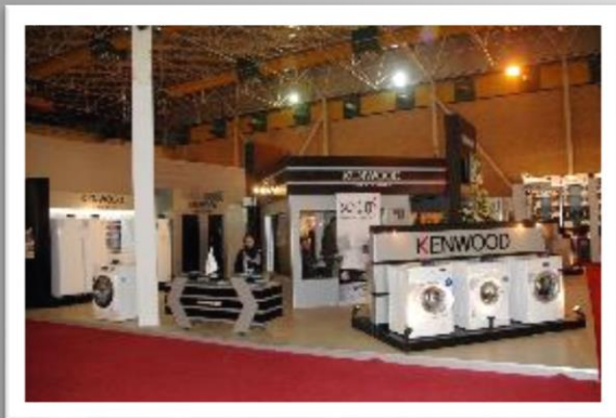
Tehran exhibition 2010

Ability to create exhibitions, within international standards is what we can promise on the shortest notice.