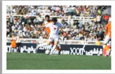
Sport Sponsoring National Football