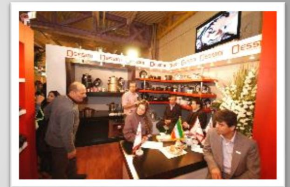
Dessini exhibition Tehran 2008