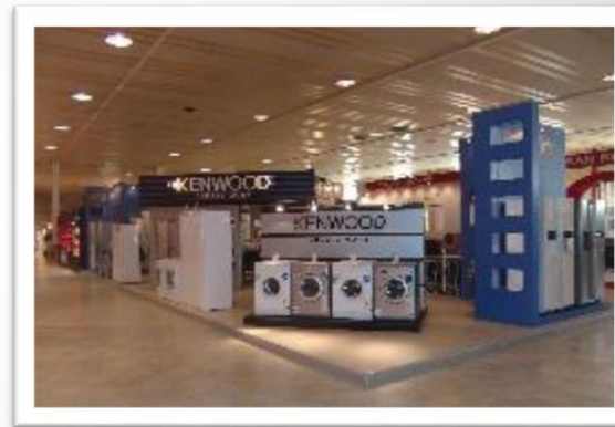
Kenwood exhibition Tabriz